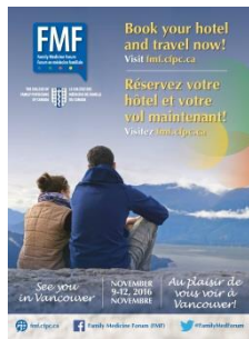
EXHIBIT HALL GUIDE

Donate a prize of a minimum $100 value to the Research & Education Foundation silent auction and you will receive recognition in the auction catalog, promotion in the CFPC newsletter and free logo inclusion in the Exhibit Hall Guide ($250 value!) NO FEE